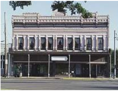
Ford Museum on Homer Courthouse Square

A good place to begin your introduction to the parish is the Ford Museum on the Square in downtown Homer. The parish Chamber of Commerce is in the museum. Here you will find brochures, maps, and residents who will help you find your way.