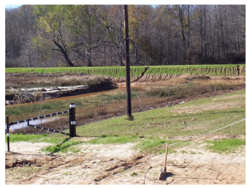
New Boat Ramp